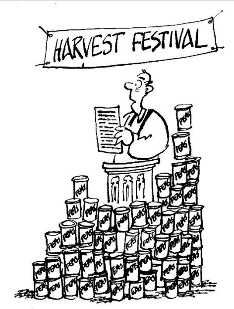
...I take it our local supermarket has a rather good offer on tinned peas at the moment!