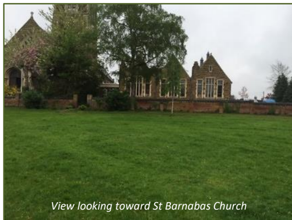
View looking toward St Barnabas Church

Eight churches, each special in their own way, but all being Christian witness to the whole community of Leighton Linlade & the villages of the Ouzel Valley